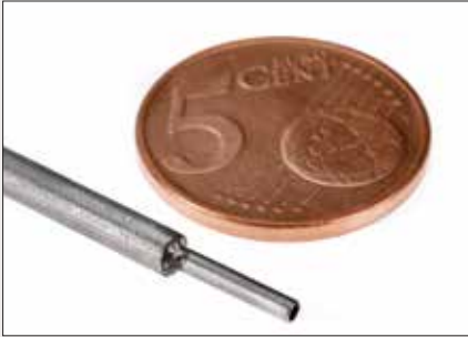
Tight welding of pressure lines