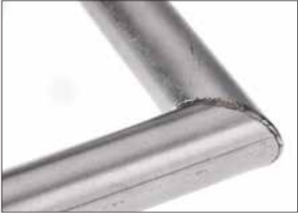
Weld seam for tube corner joint