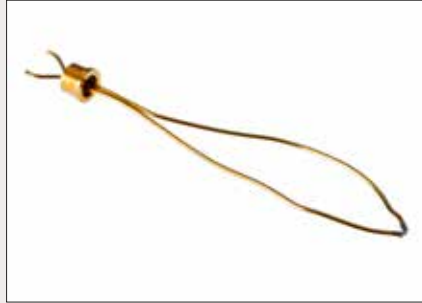
Manufacturing of temperature sensors (Illustration shows gilded platinum sensor)