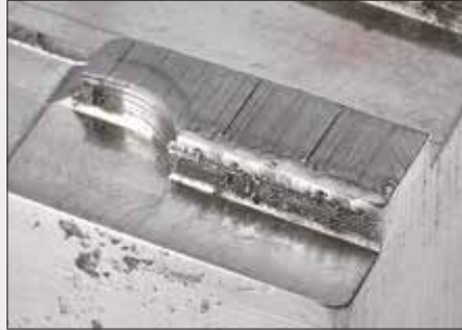
Weld cladding of edges