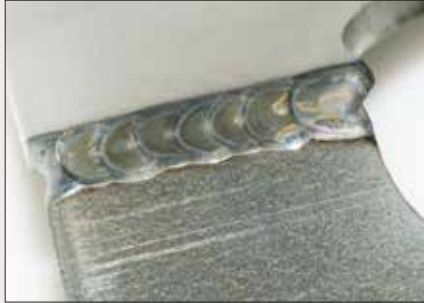
Welded joints of different materials